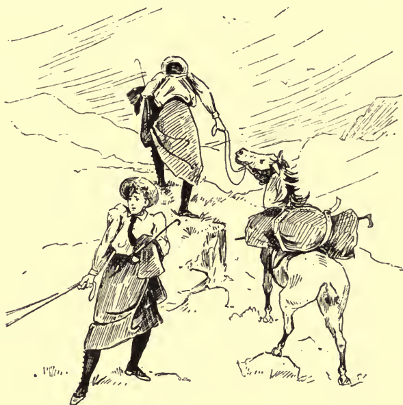
The ascent of the Deans .

Tommies tore at the wiry little rushes which grew all about, we looked down a deep, empty valley